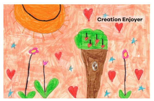
There are flowers and trees because I like them and they are beautiful. I love creation. Grade 1 Student