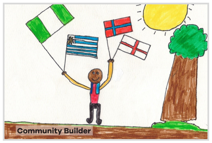
There are flags that represent people from all around the world that come to our school. We are a community here. Grade 4 Student