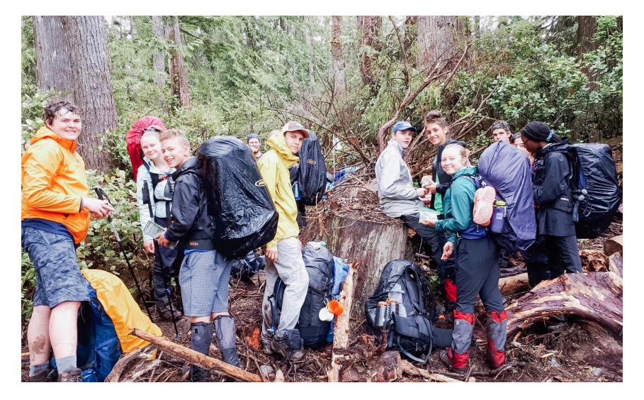
West Coast Trail group 2019

May 28 was a beautiful day on which the elementary school held its annual Track and Field Day. Students participated in events such as running races, long jump, high jump and shot put. Once they were finally tired, the students were thrilled to reach the rest stop, where they each received a freezie. And to make that rest stop even better, there were special guests at the freezie stop, waiting for them. These guests were seniors from Shalem Manor, who took time from their day to hang out with us and hand out freezies. What a special way for our two communities to connect. and we look forward to more of these activities together!