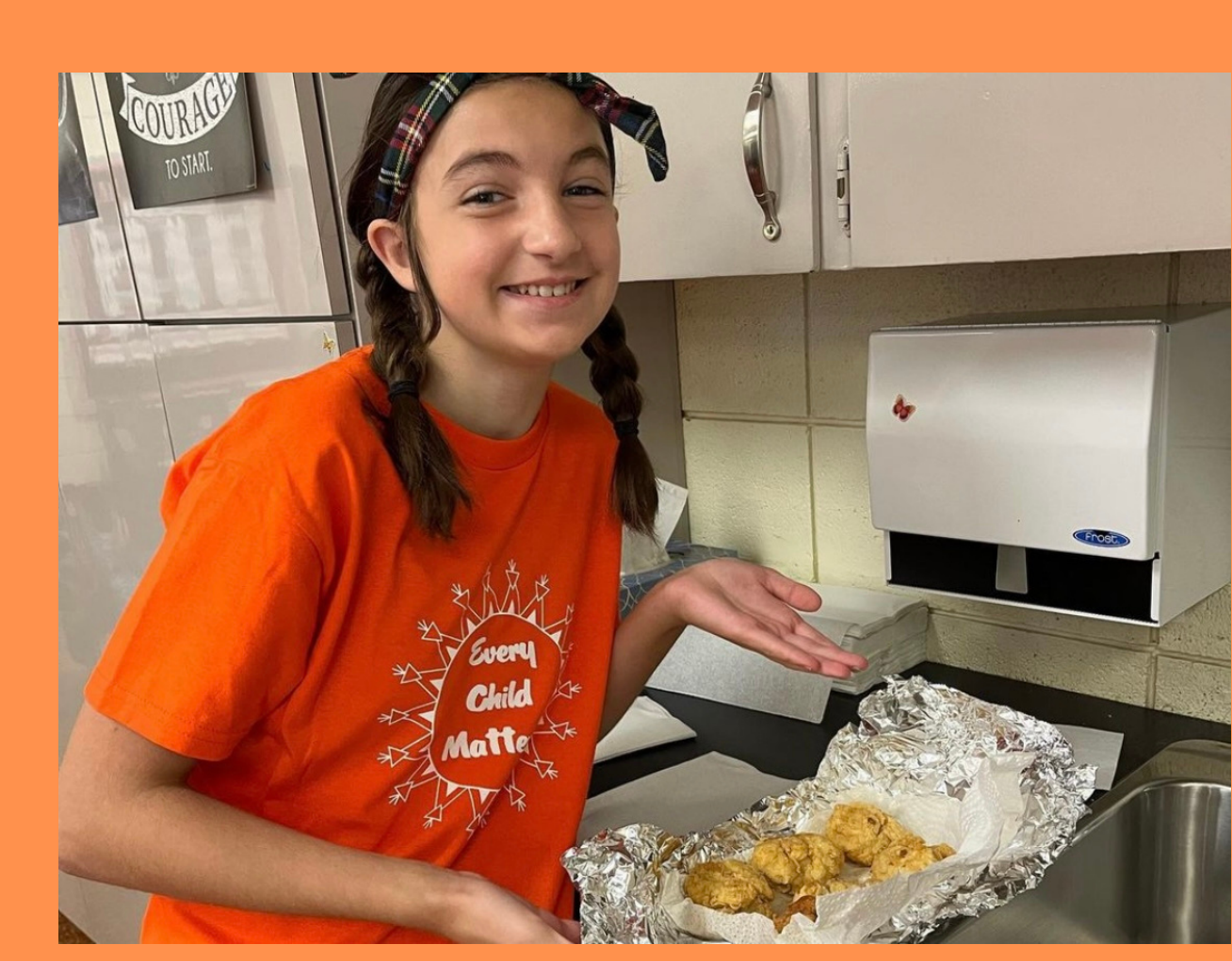
Grade 6 student sharing homemade bannock and jam with the class

Through art, stories, music, talking and listening, elementary students engaged in learning about the meaning of Orange Shirt day and the National Day for Truth and Reconciliation.