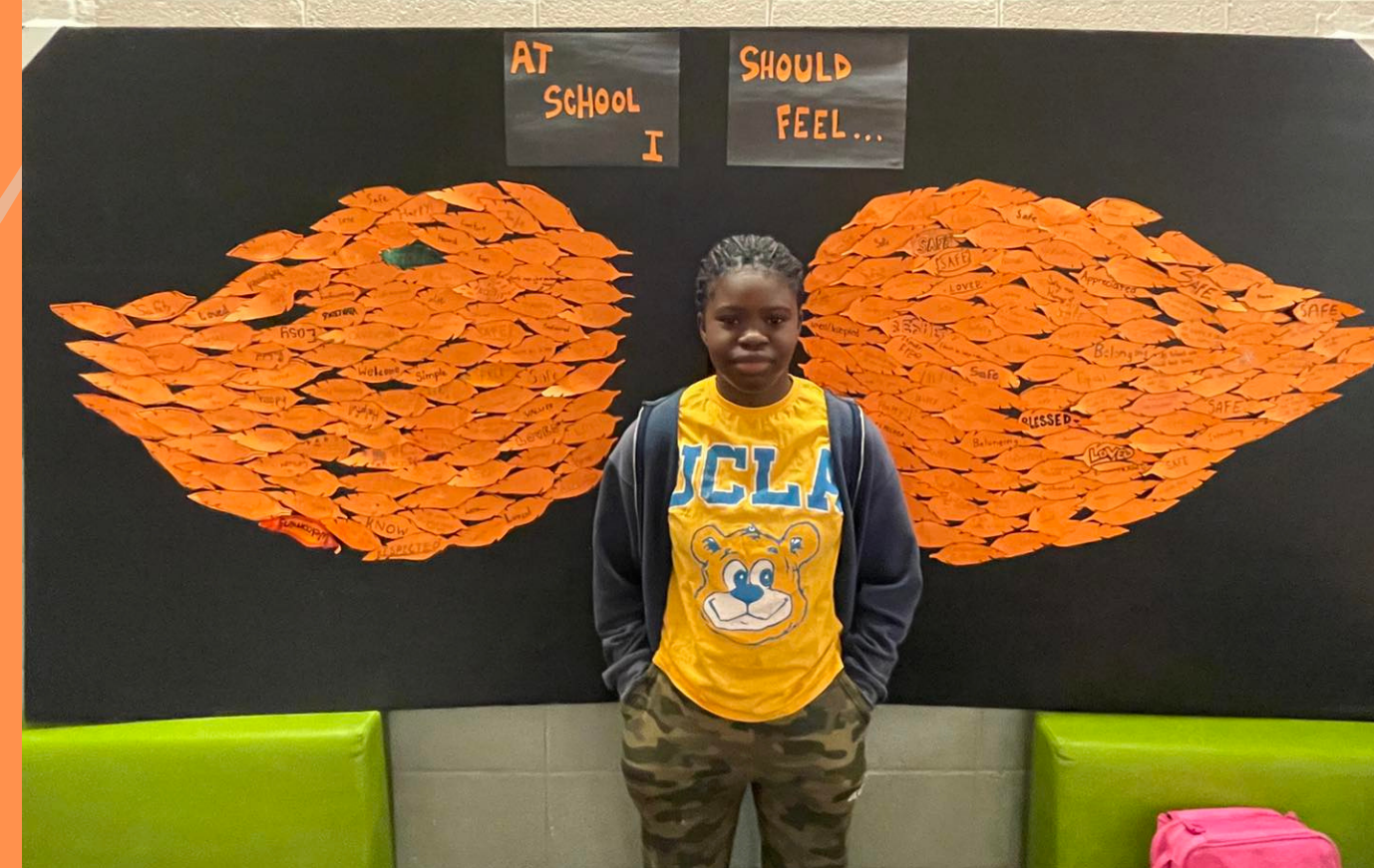
Students were given an opportunity to think of a word that describes how students SHOULD